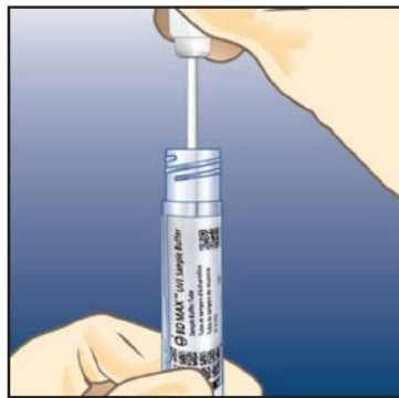
1. Fully insert the swab into the tube so that the tip is at the bottom.