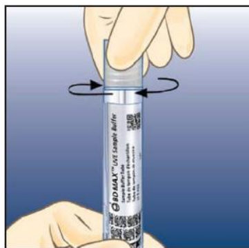
3. Tightly recap the tube.