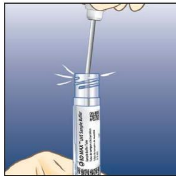
2. Carefully break the shaft at the score mark.